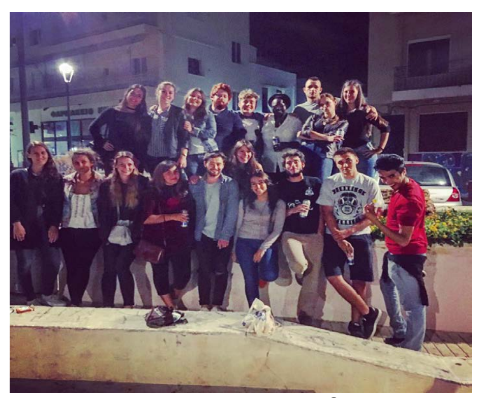
Our Winter Erasmus Family ©

As a summary of my experience I will just emphasize one thing – after first semester I decided to extend my Erasmus here and stay also for summer semester. That shows how much I enjoyed my experience in Rethymno ©