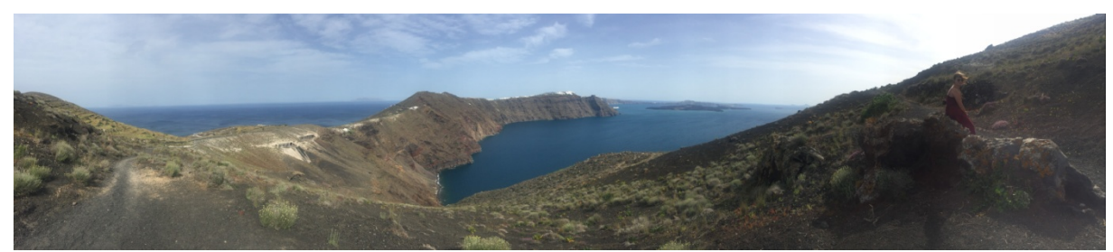
Hiking from Thira to Oia, Santorini