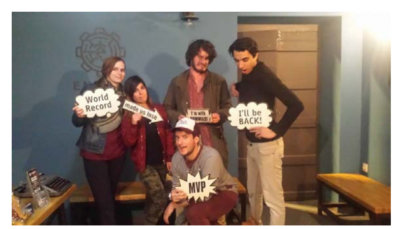
Enigma Escape Room in Rethymno