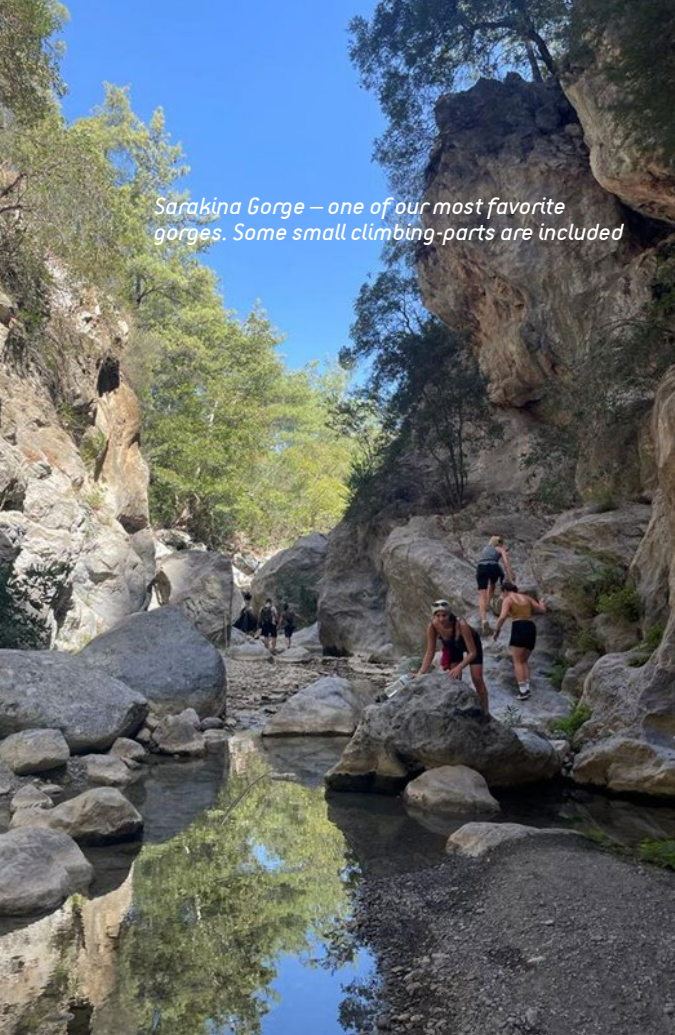
Sarakina Gorge – one of our most favorite gorges. Some small climbing-parts are included