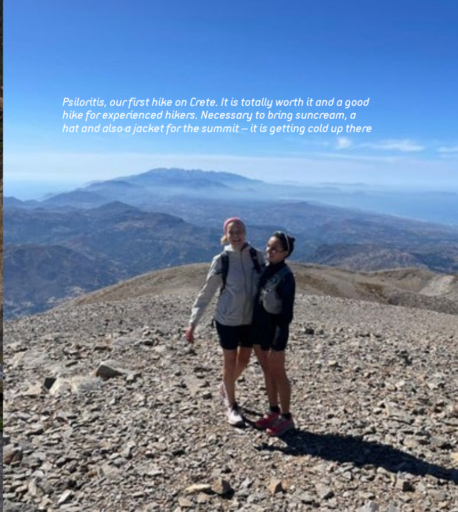
Psiloritis, our first hike on Crete. It is totally worth it and a good hike for experienced hikers. Necessary to bring suncream, a hat and also a jacket for the summit – it is getting cold up there