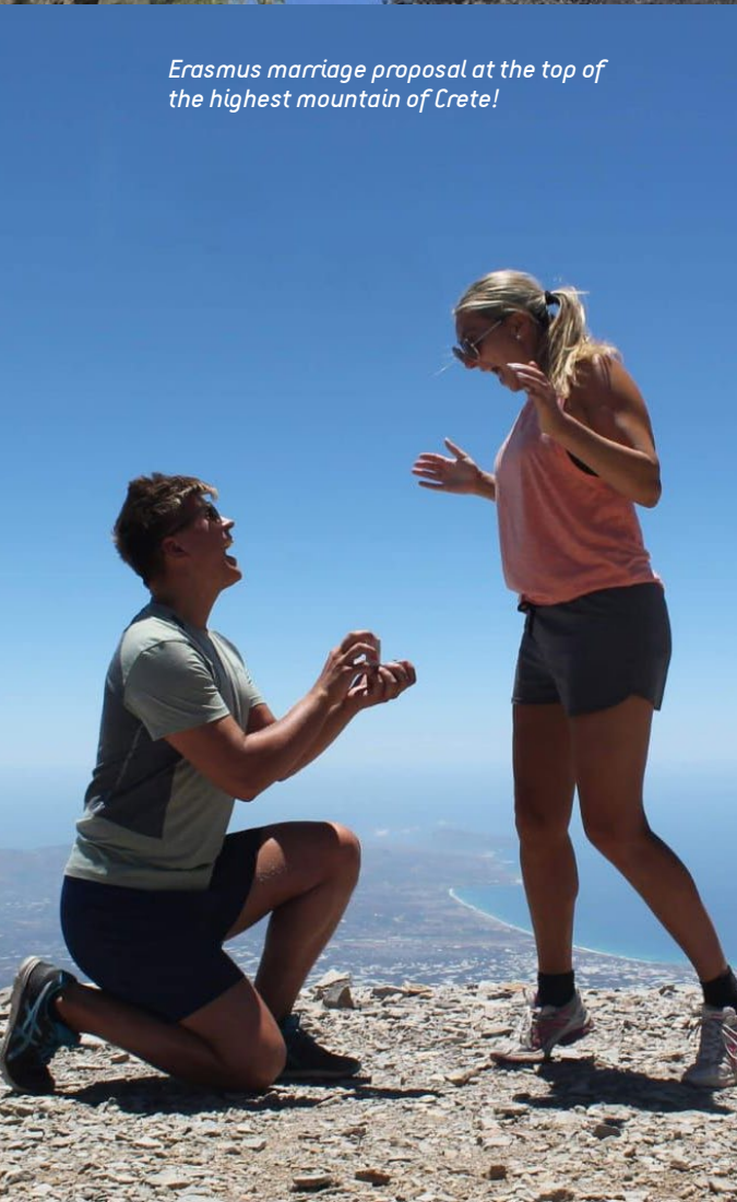
Erasmus marriage proposal at the top of the highest mountain of Crete!