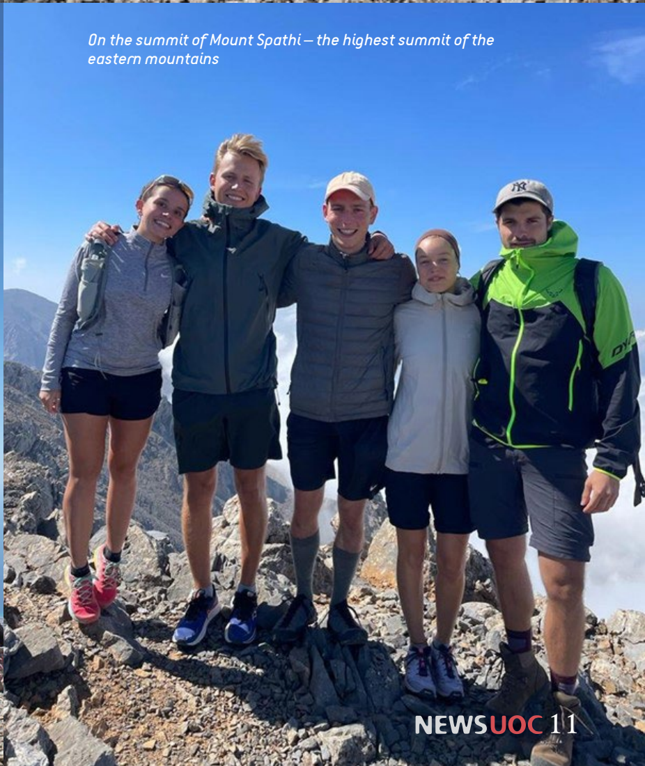
On the summit of Mount Spathi – the highest summit of the eastern mountains